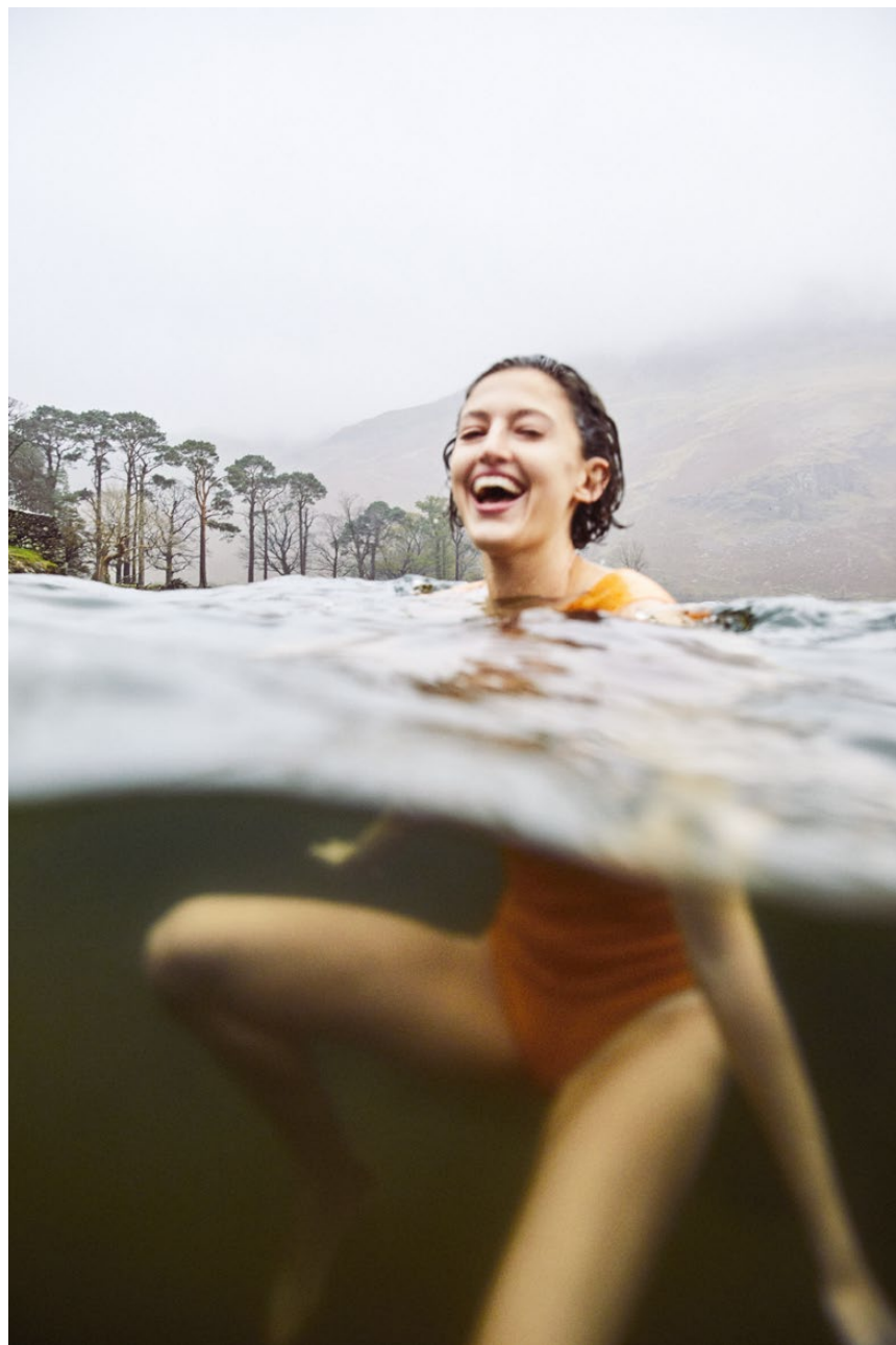
AMBER, IN THE LAKE DISTRICT - LITERALLY.