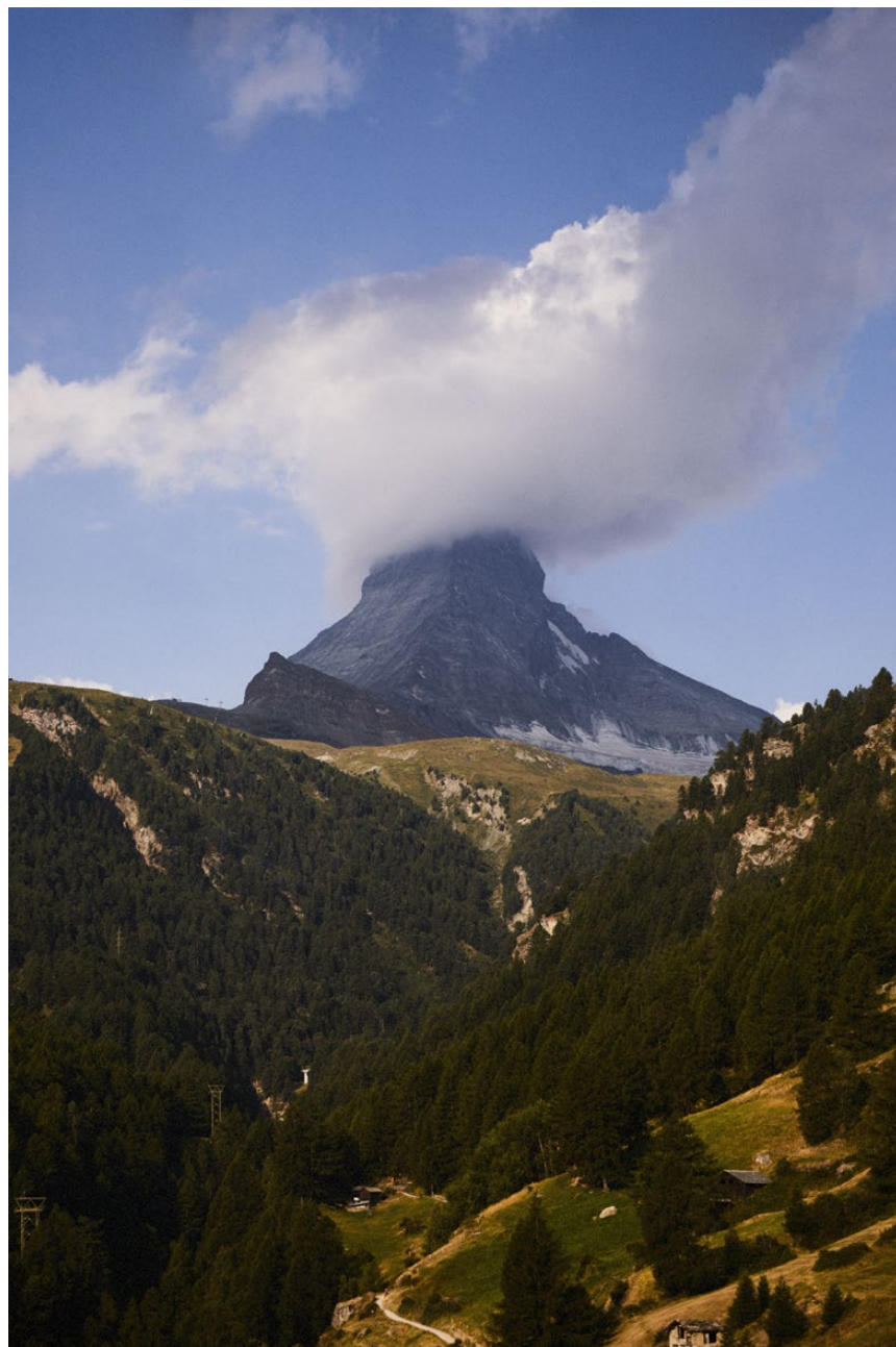
THE MATTERHORN (GENG SHY)