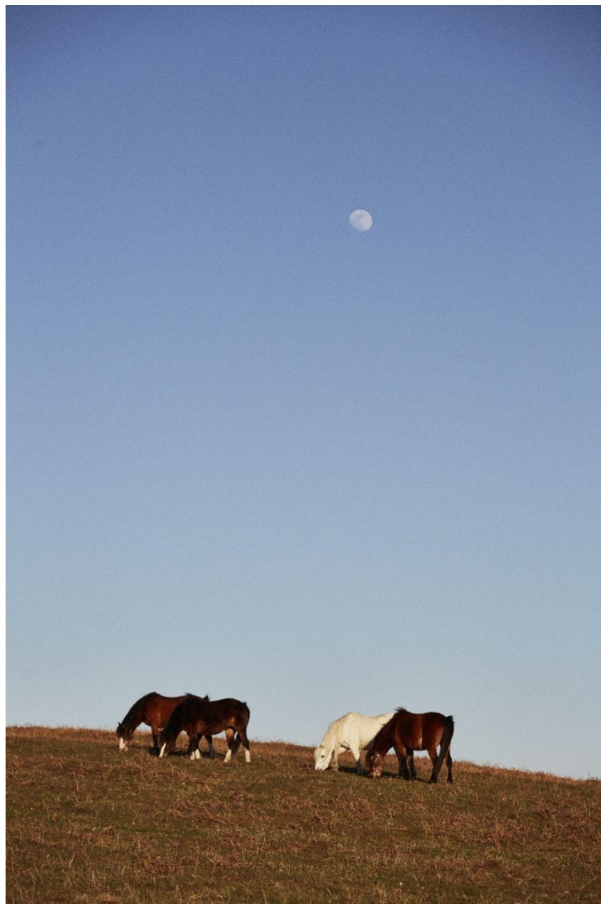
HORSES + MOON