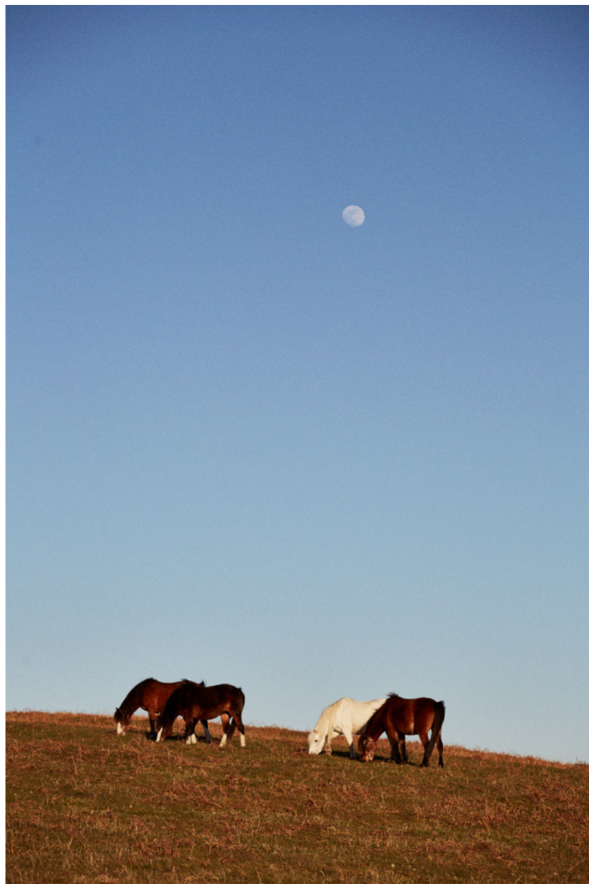
HORSES + MOON