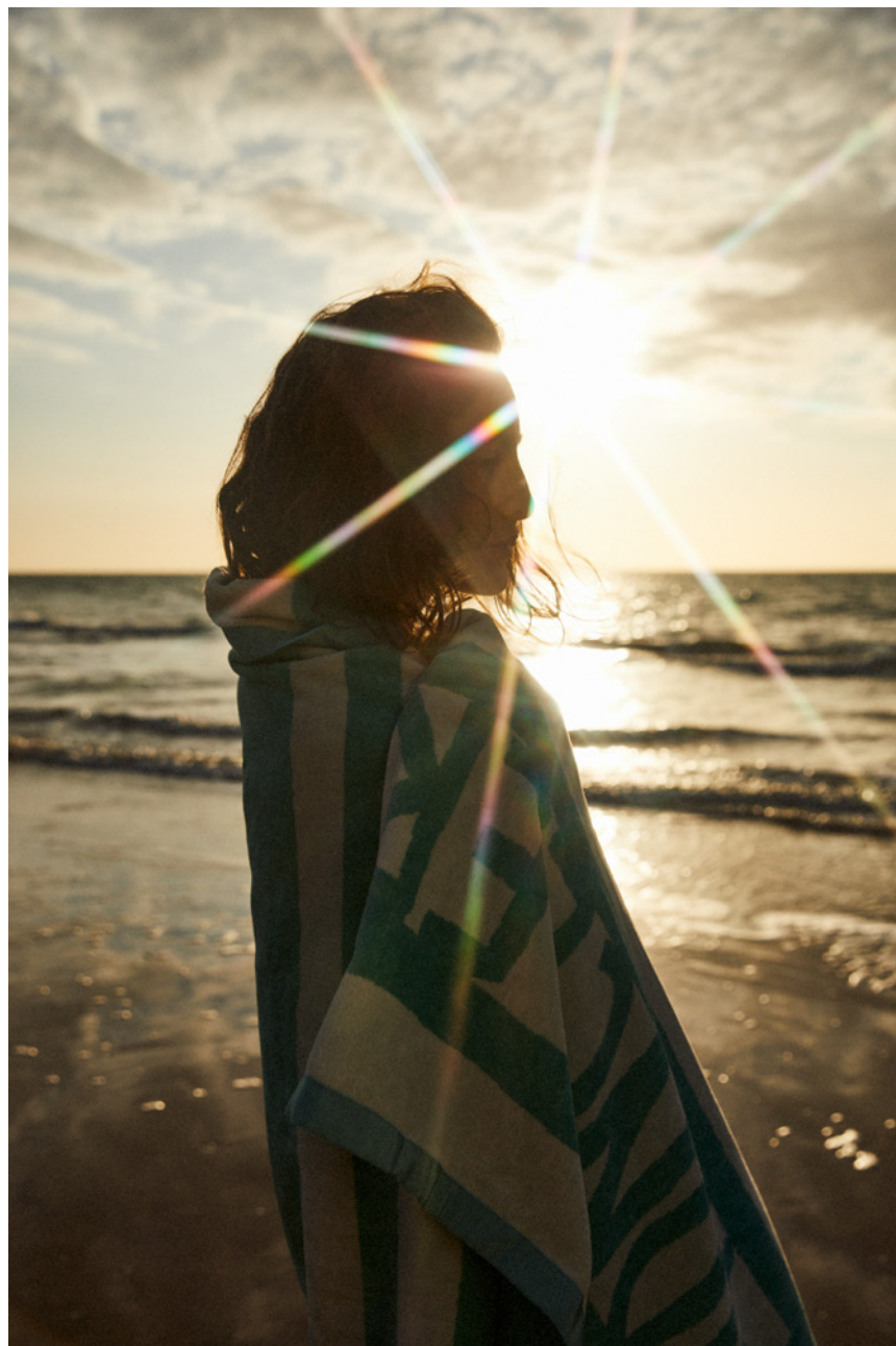
SUNRISE WITH HEATHER